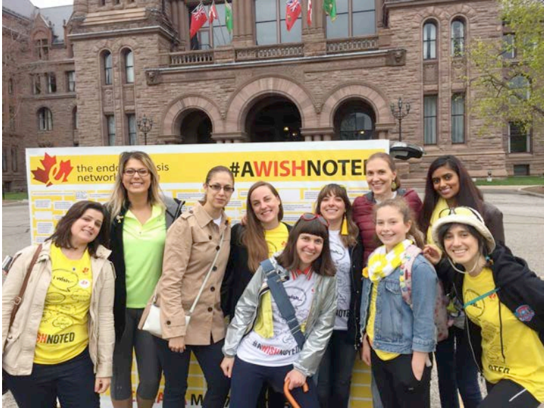
EndoMarch Toronto 2016