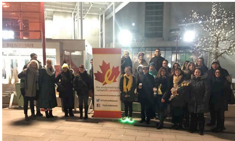
CN Tower meet up 2017