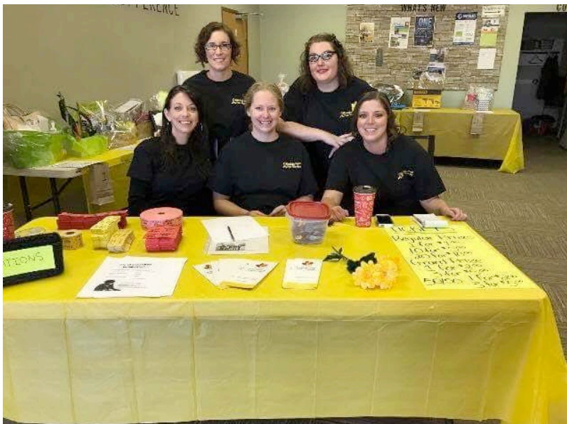
Winnipeg Craft Sale 2017