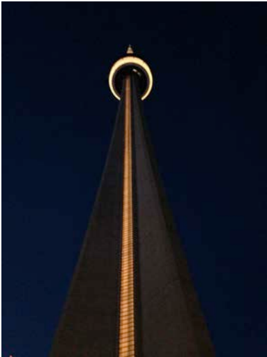
The CN Tower lit yellow for endometriosis awareness.

These photographs have been added with the permission of the subjects depicted and/or the photographer. They have been included with the understanding that they may be used in the media.