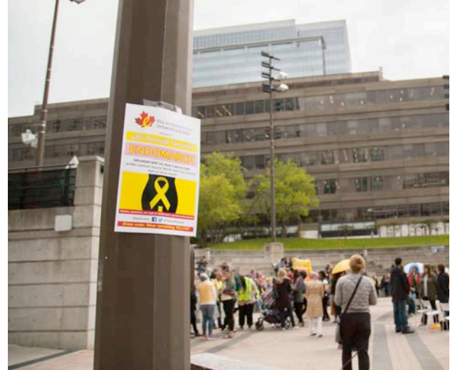
Endomarch Toronto 2017