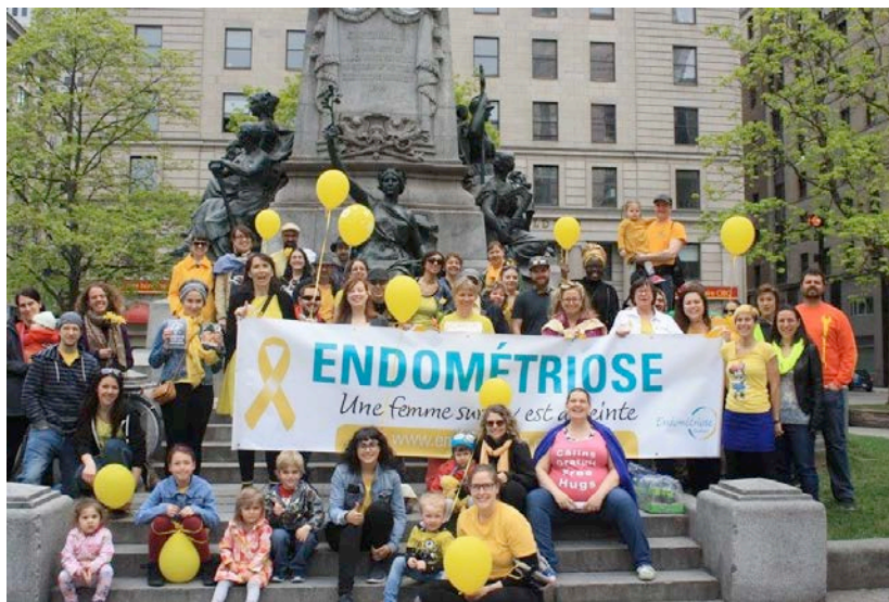
EndoMarch Quebec 2017